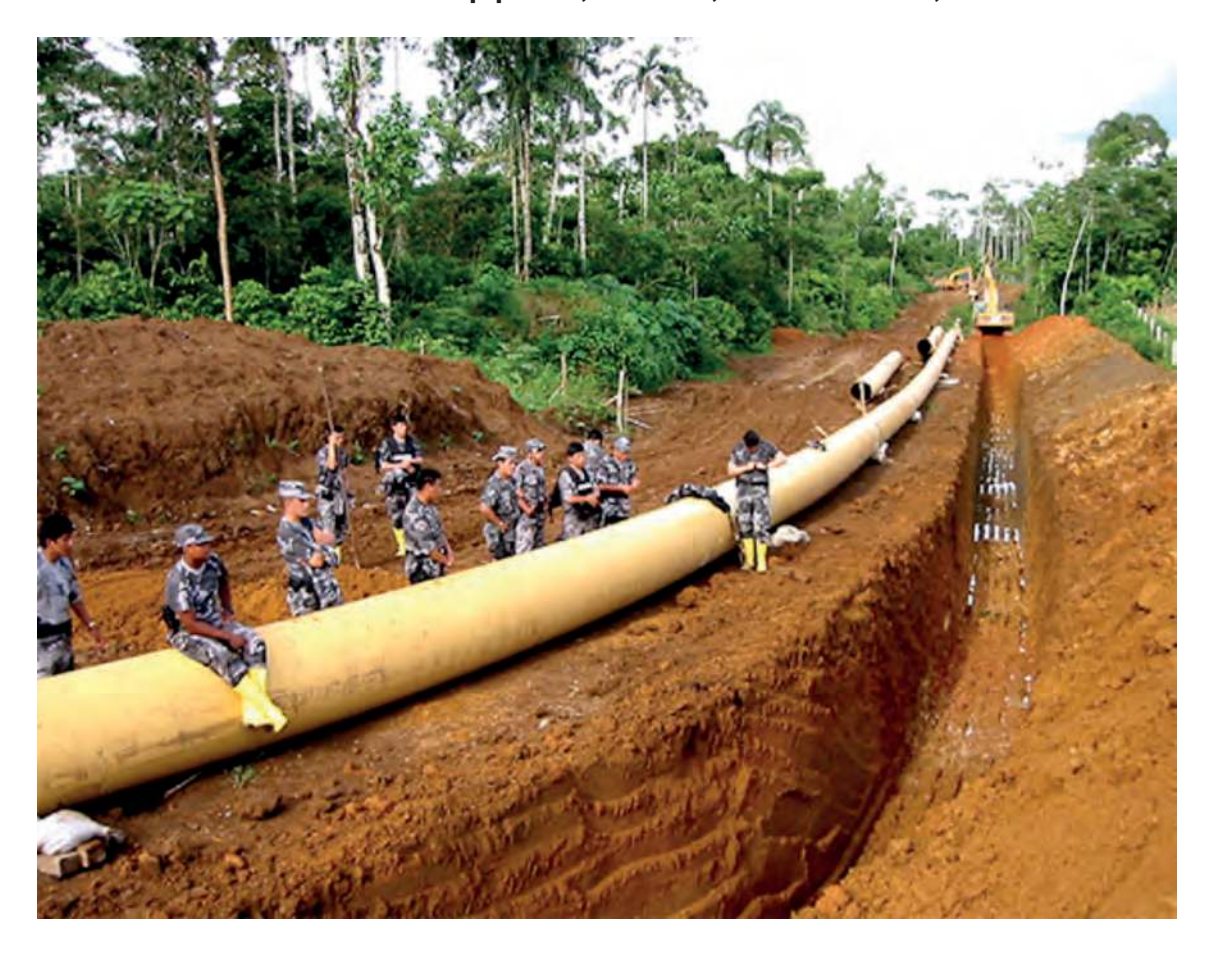
Photograph A for Question 4 Construction of oil pipeline, Ecuador, South America, 2003